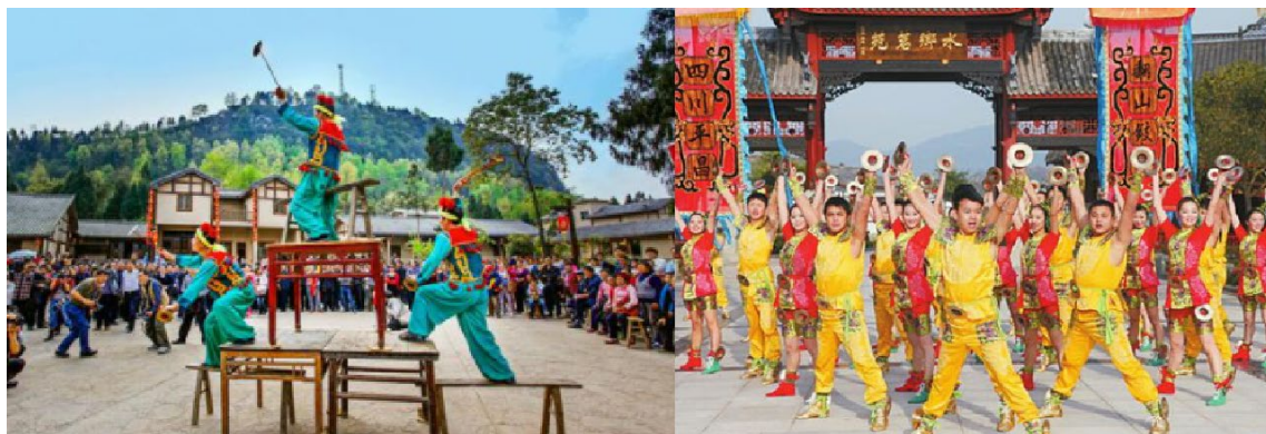
Figure 1 "Fanshan Jiaozi "dance performance

"Fanshan Jiaozi", a dance art, is rich and changeable. It can be presented on a grand scale in festivals and celebrations, and it can also be improvised in simple folk occasions. During the performance, the dancers wore colorful traditional costumes and held special hinges (a percussion instrument) to dance lightly with the beat of music. Their vigorous dancing shows the bravery and boldness of the Bayu people, and also conveys their enthusiasm and vision for life, as shown in Figure 1: